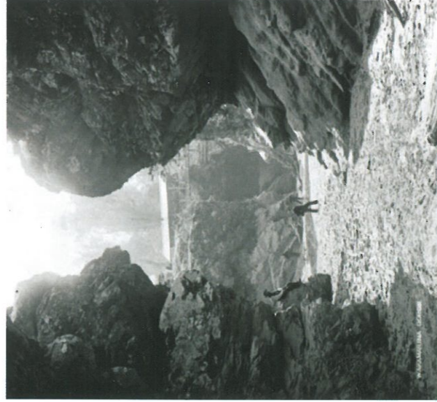
Dried out Wakamarina Gorge 1890 after the river was diverted by miners

By the 1870's it was realised that the easily accessible areas had been mined out, leaving the river terraces and leads which needed intensive labour and often expensive technology to work, i.e. water races, dams, trams and pumps.